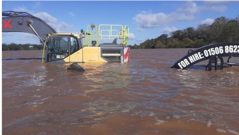
One of the construction vehicles that ended up deep in floodwater.